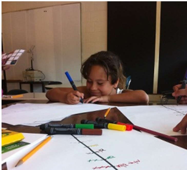
Blackstone student at IBA using colorful creativity to master graphing concepts

Teachers and staff derived a common program theme of “community” in the Summer Learning partnership between Inquilinos Boricuas en Acción (IBA) and the Blackstone Elementary School. The math and ELA standards are actively connected to the following subthemes: people, recreation, architecture, and economy. For example, students ask questions of their peers related to community and graph the answers. Art projects related to the subthemes reinforce ELA concepts and students complete journal entries related to program activities. To the teachers and staff within the partnership, Summer Learning is about finding meaning and learning behind every hands-on activity for the 30 rising 4 th and rising 5 th graders served. It all adds up to a very busy and educational summer in Villa Victoria in the South End!